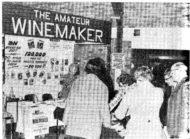
Right: Visitors to the exhibition congregate around "The Amateur Winemakers'" stand in the exhibition Hall at Harrogate.