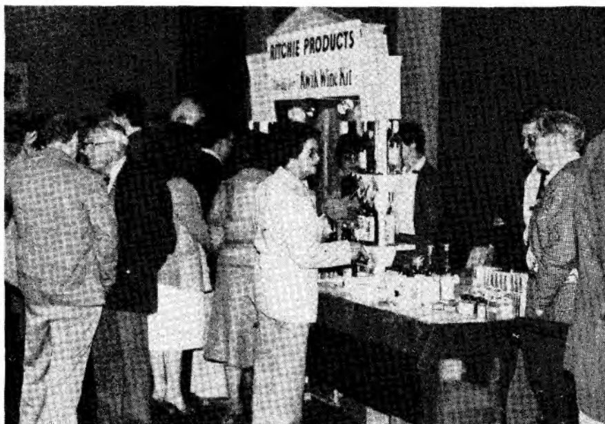
No lack of business at Ritchie Products' stand!

Competitors were able to discuss their entries with the judges in "Judges At the Bar" during the afternoon and many took advantage of this opportunity, and a panel of experts, past and present presidents, gathered later to answer questions.