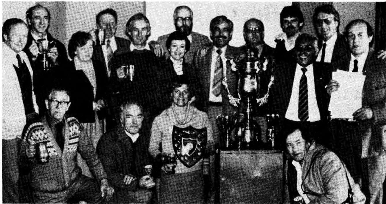
Tyneside Nationals, jubilant after winning the AW Shield and a mass of other trophies.